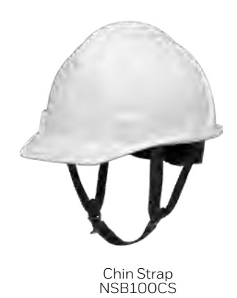
HONEYWELL NORTH SHORT BRIM HARD HAT VENTED